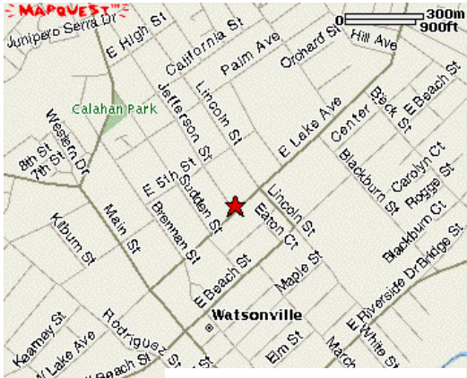
Youth Services South 241 East Lake Ave.